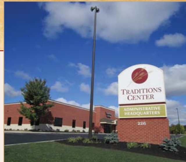
The building at 226 Pauline Drive was transformed from an empty shell into the Administrative Headquarters of York Traditions Bank over the past six months. The bank's Business Services, Mortgage Services, Deposit and Loan Operations and Executive Administration staff moved into Traditions Center on August 19, 2013.

York Traditions Bank held a ribbon cutting on Tuesday, September 17, 2013 officially celebrating the opening of Traditions Center, our new Administrative Headquarters, located at 226 Pauline Drive in York Township. The acquisition of the 28,000 square foot building -