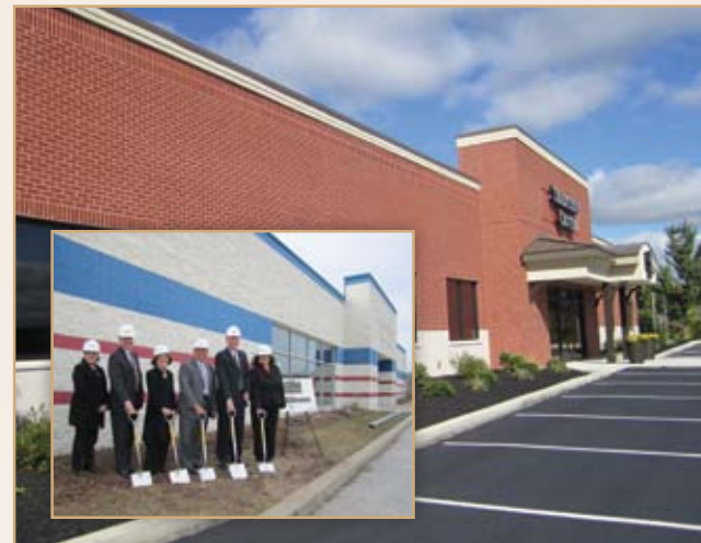
Pictured (inset) is the front of the former Room Store building as the Project Manager and Senior Staff of York Traditions Bank broke ground in March. Pictured (above), the same angle of the Traditions Center is seen after the front wall was demolished and a new facade was erected.