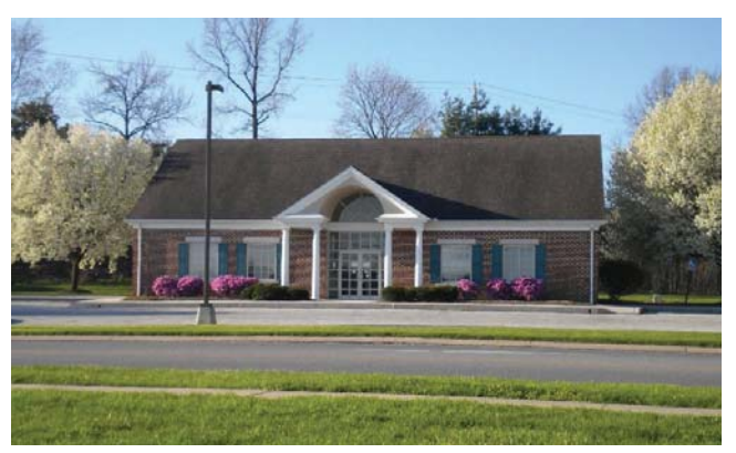
2170 White Street • York

We're pleased to make our geographical coverage even more complete, with the soon-to-open White Street Branch, expanding our presence in the western part of York County. The branch opens this Fall. We look forward to meeting new customers in the area, and to providing a new level of convenience to current customers who live, visit, work, or shop nearby.